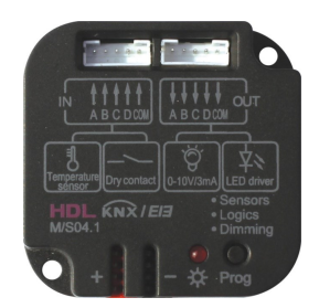
Figure 1, KNX 4-Zone Dry Contact Module